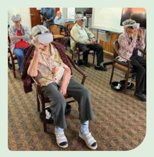
Residents enjoying our VR Opera trial