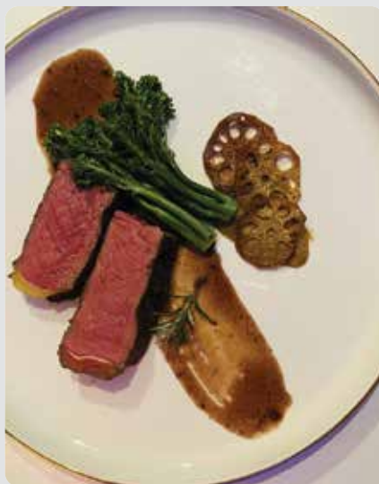
Above: Two of Huan's culinary creations