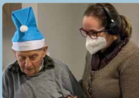
Our residents and staff enjoy any excuse to dress up and have a party. Our residents loved making their own coconut balls and were treated to a slap up mid-year Christmas feast.