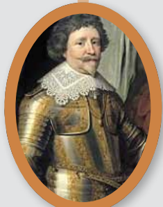
Frederick, Prince of Orange