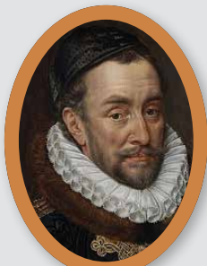
William I, Prince of Orange