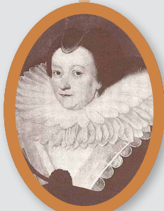
Countess Charlotte Brabantina of Nassau