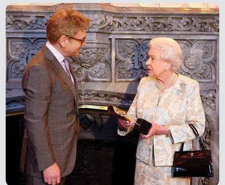
From top: Meeting the crowds in Australia; With Julia Gillard in 2011; With Prince Philip at her beloved Balmoral; Receiving her BAFTA from Kenneth Branagh.