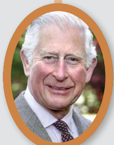
King Charles III