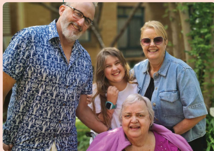
Above: Family visit to ABH's Bluebell garden.

I've always been very crafty, I used to make things to sell. When I was 35 I started making porcelain dolls. I used to bring the dolls to Sydney and sell them on consignment, but then I started selling them in my own shop in Gulgong, near