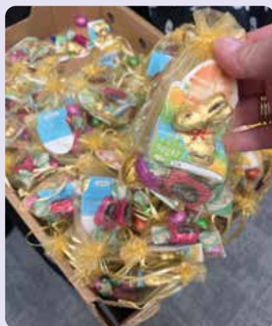
Celebrating Easter deliveries