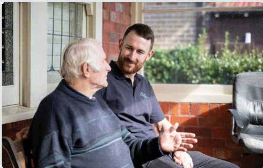
Above: Chatting with a home care client

I love Kookaburras and gained the trust of a wild one, who comes inside and hangs out with me. I named him Kevin and his favourite treat is raw chicken.