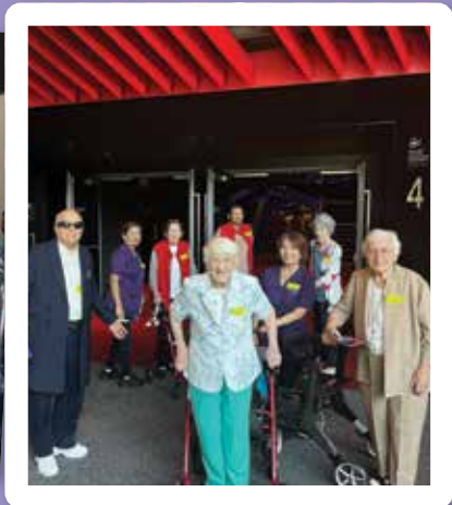
From left: Afternoon cards; Waiting at the Opera House for the Premier’s Concert.