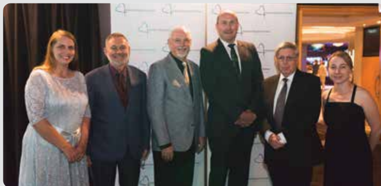
From left to right: 1946, at home; 1971, getting engaged; 2018, The ABH Board at the AH Orr 40th Anniversary.