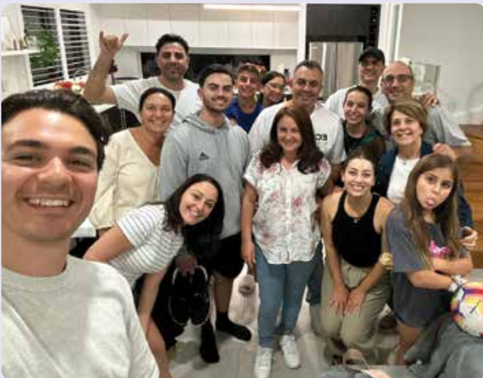
All the family.