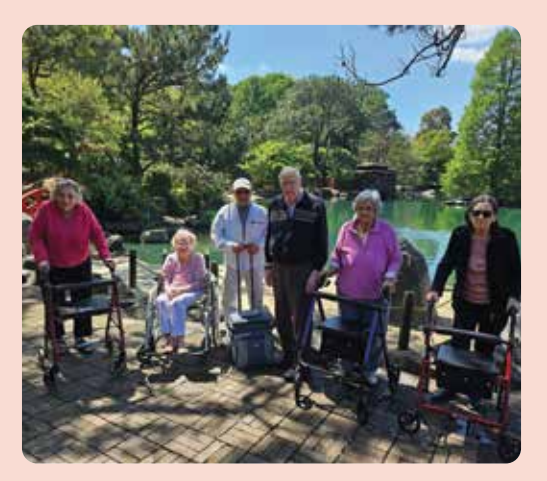
Above: Residents enjoying a trip to Auburn Japanese Gardens.

Wishing each and every one of you a happy, peaceful and safe festive season and new beginnings for 2025.