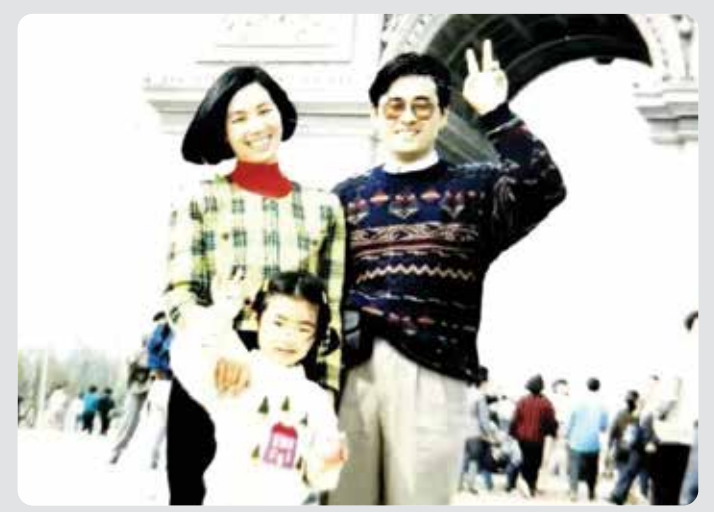
Left: Family visit to Wuxi, China. Right: Yellow Mountain, China.

I enjoy talking to all our residents and their family representatives, learning about their life experiences, their preferences and their characters. It is very rewarding to contribute to their increased quality of life and wellbeing.